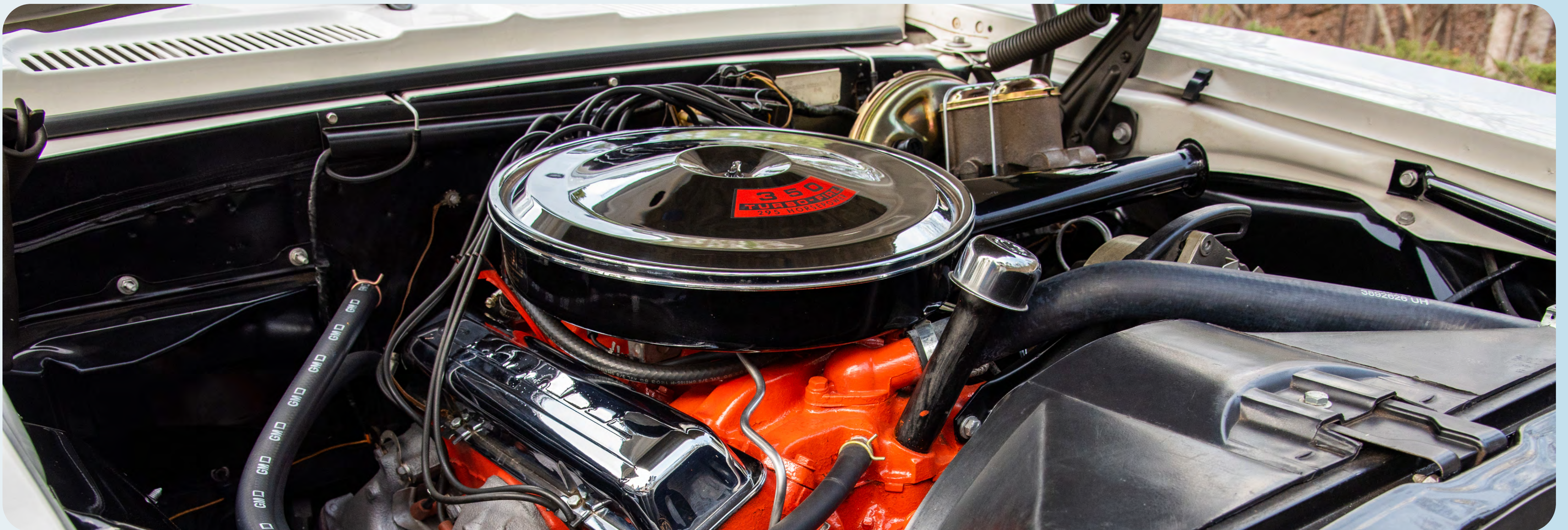
Original "numbers matching" 350 V8 (295 hp)