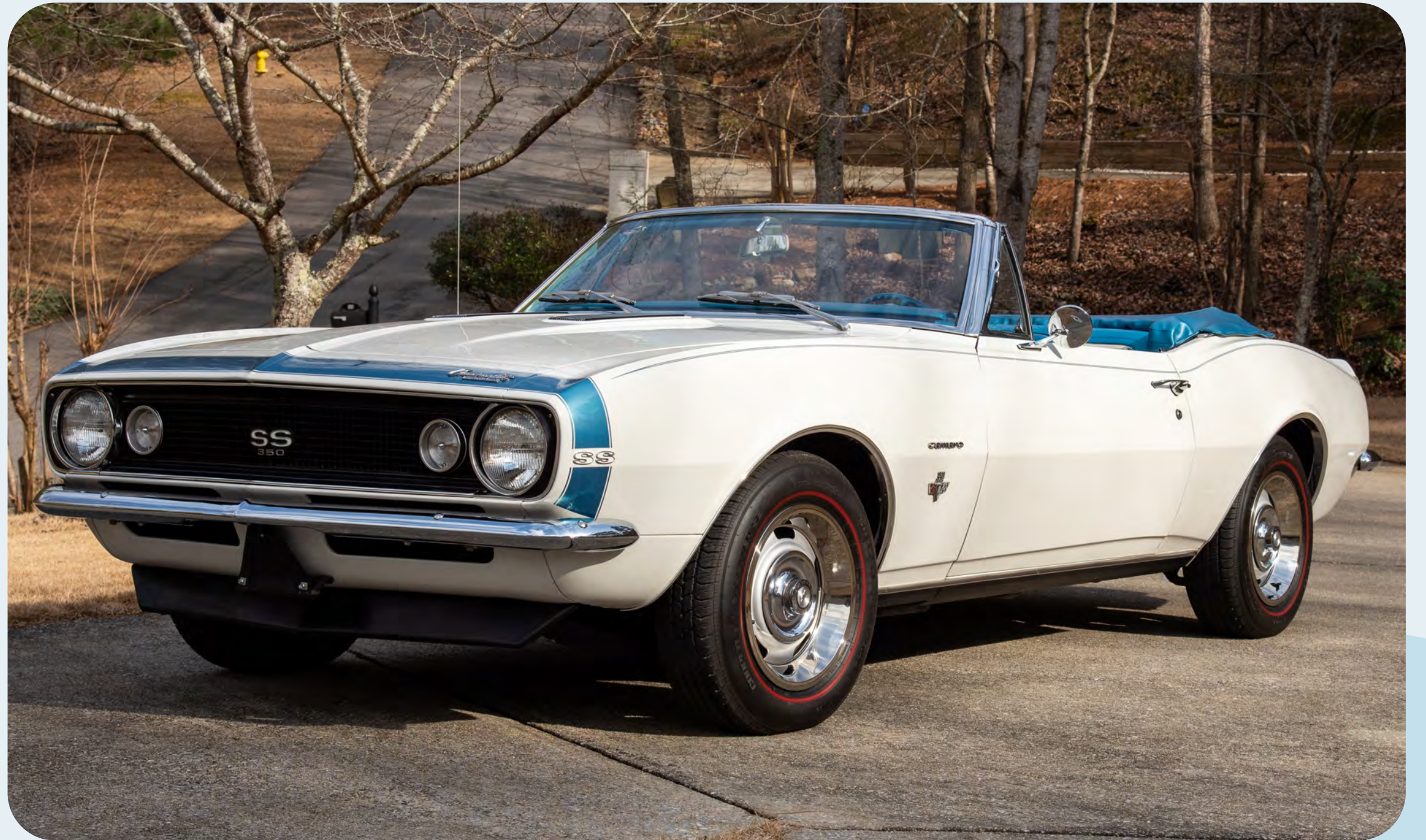
Ermine White with Bright Blue interior

The 1967 Camaro was Chevrolet's answer to the Ford Mustang and General Motors entry into the Pony Car market. With the overwhelming success of the Mustang, GM hit the market with a media blitz: producing a half-hour show called "The Camaro" and a musical play shown in 25 cities called "Camaro!" The SS performance-oriented model became the start for one of the most revered, and still produced, engines: the small-block Chevy 350 V8.