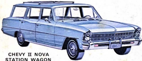
CHEVY II NOVA STATION WAGON