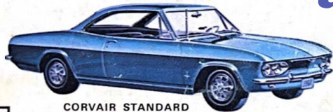
CORVAIR STANDARD SPORT COUPE