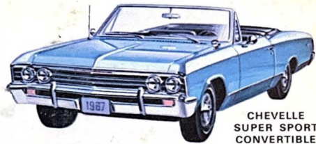
CHEVELLE SUPER SPORT CONVERTIBLE