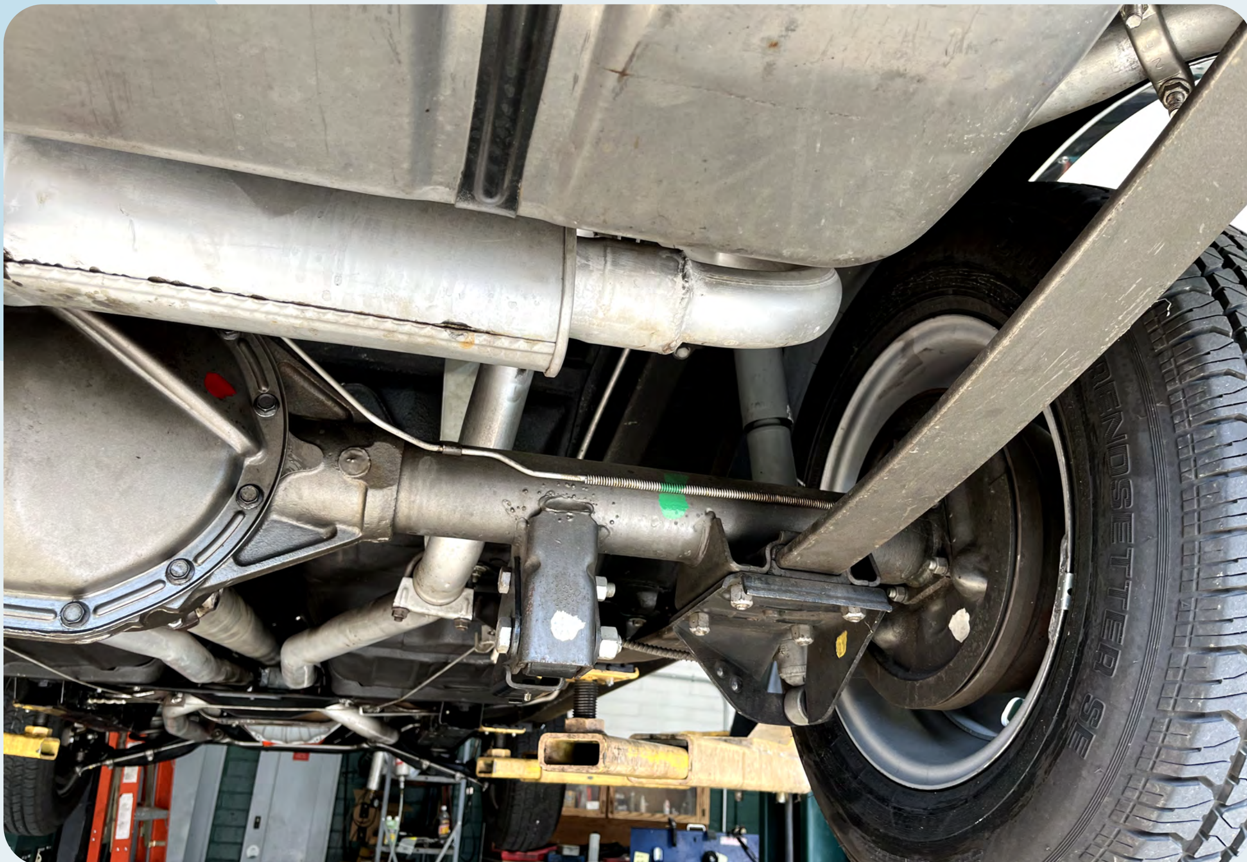
Original 12-bolt rear differential with SS traction bar