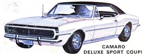
CAMARO DELUXE SPORT COUPE