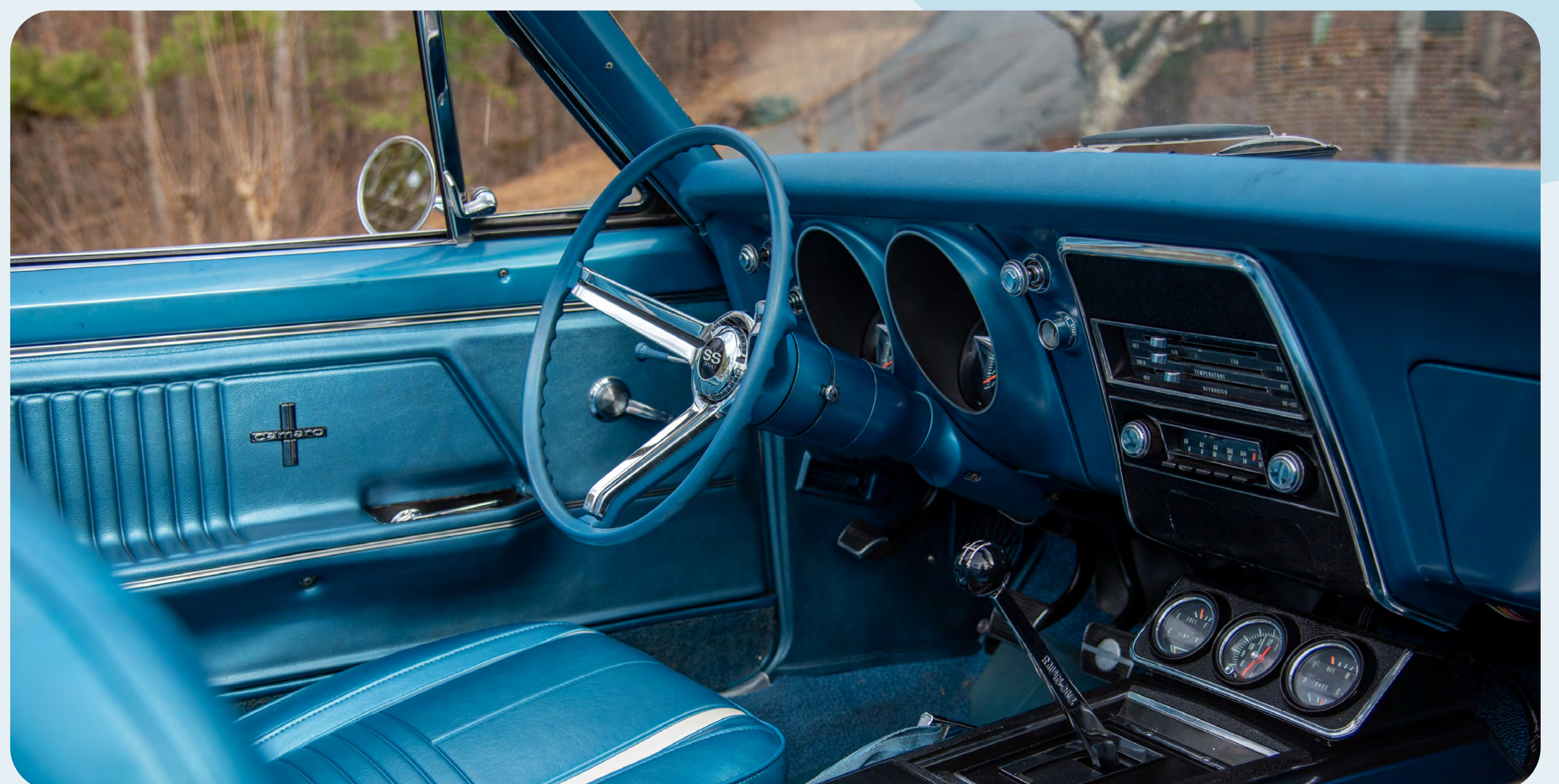
Optional deluxe interior, console, gauges, AM/FM radio, and numbers matching Muncie 4 speed