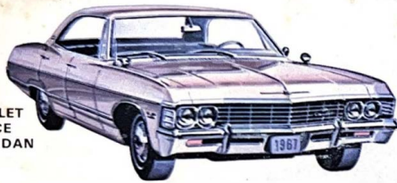
CHEVROLET CAPRICE SPORT SEDAN