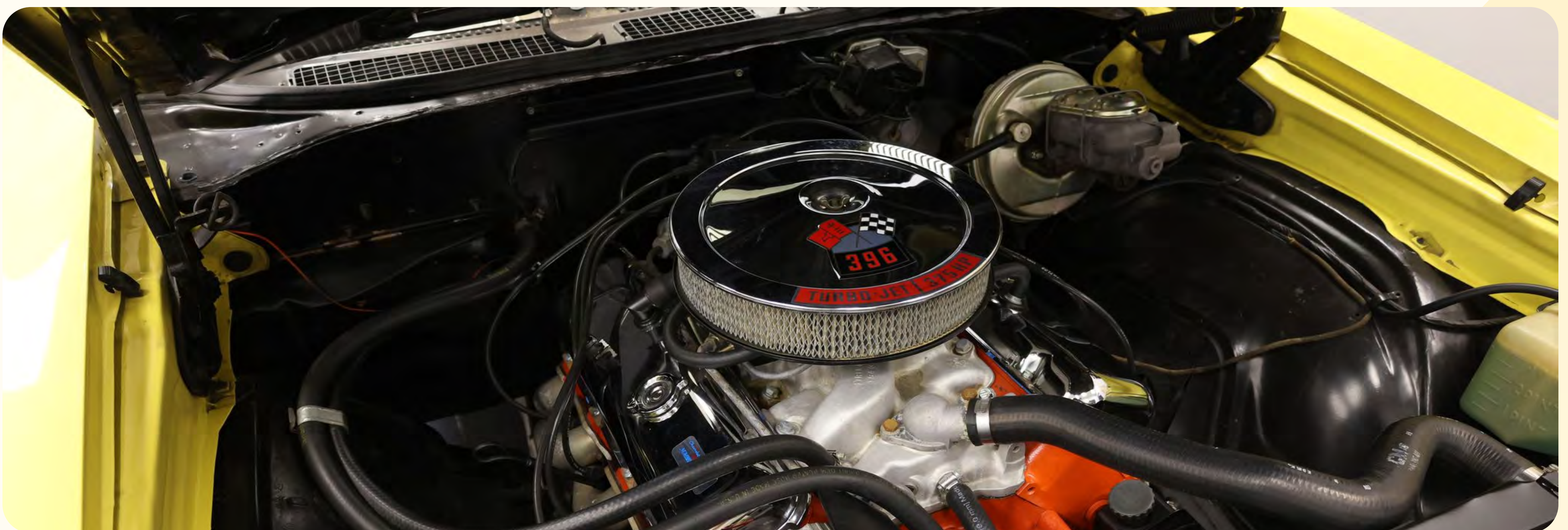
Original “matching numbers” L78 396 V8 (375 HP)