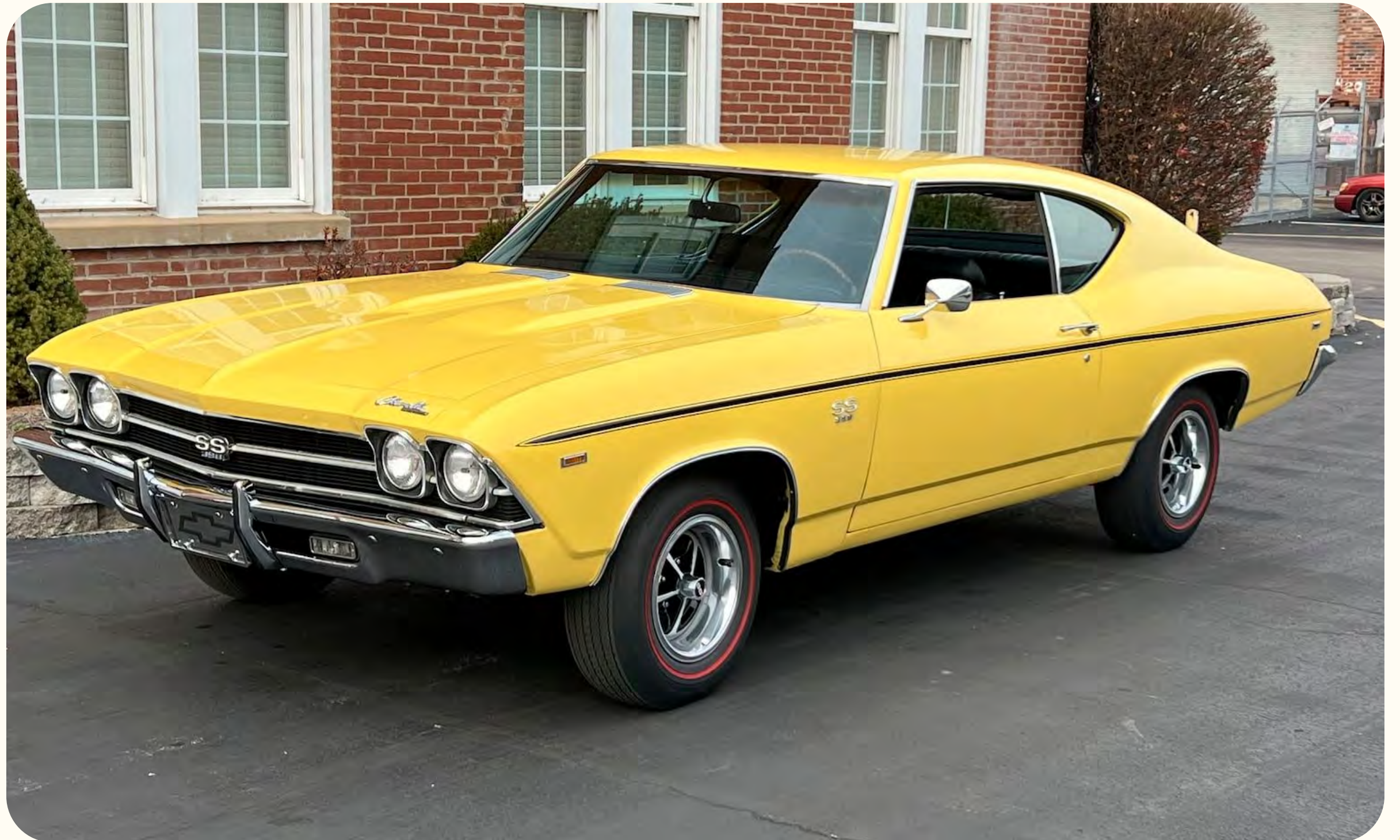
Correct Daytona Yellow (Code 76) only available on Chevelle SS cars

From the mid-1960s to the early 1970s, Detroit produced what many still consider to be the only true “muscle cars.” In 1964, just a few months after Pontiac gave the car-crazed youth the GTO, Chevrolet gave them the Chevelle SS. From 1965 to 1969, the top performance choice was the L78 396 big-block engine. Factory rated at 375 hp, car magazines rated the engine closer to 425 hp. Prominent roles in Fast and Furious and John Wick have given a love for the Chevelle SS to a new youth market.