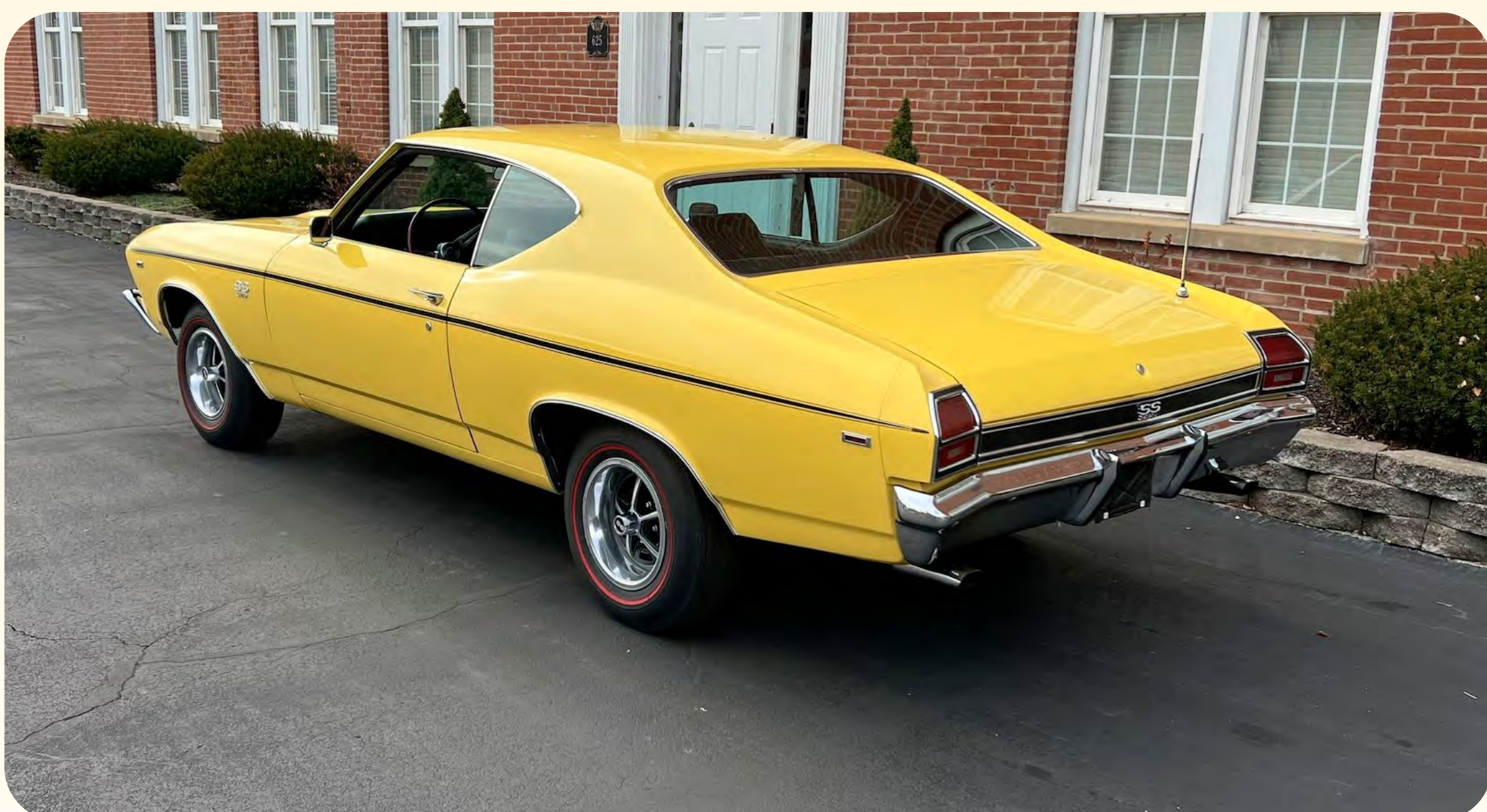
Correct SS badging and red-line tires