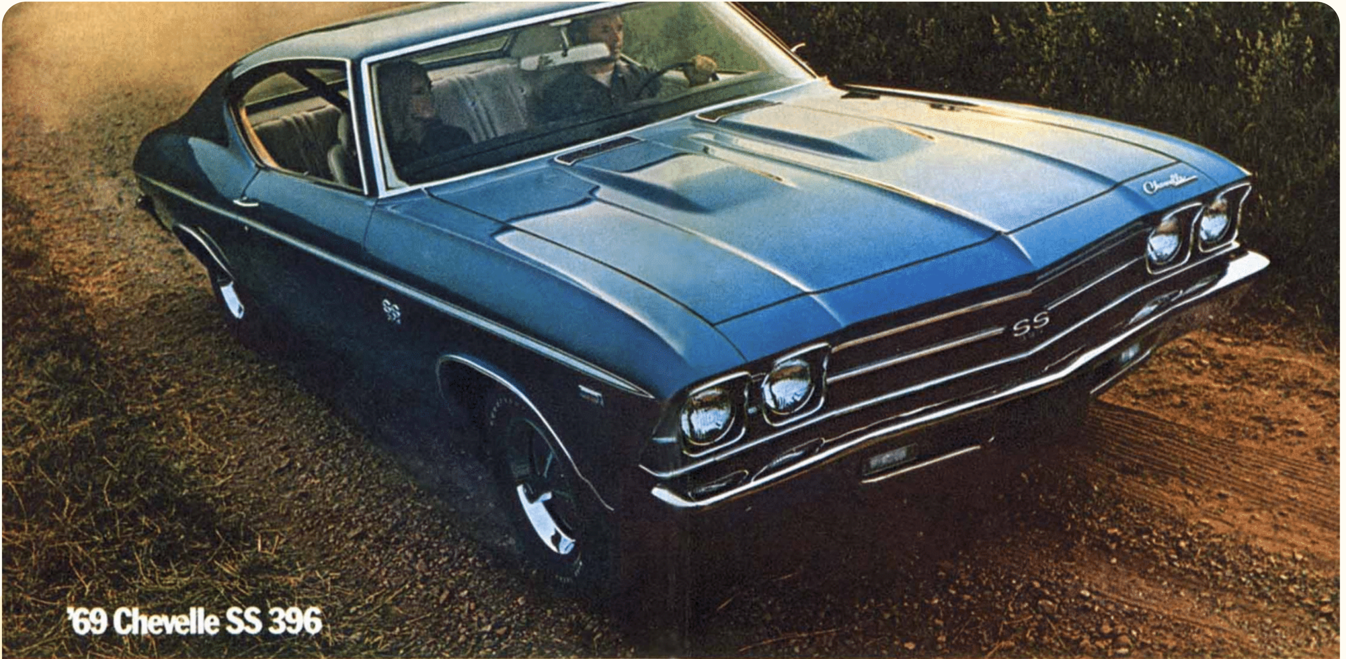
'69 Chevelle SS 396