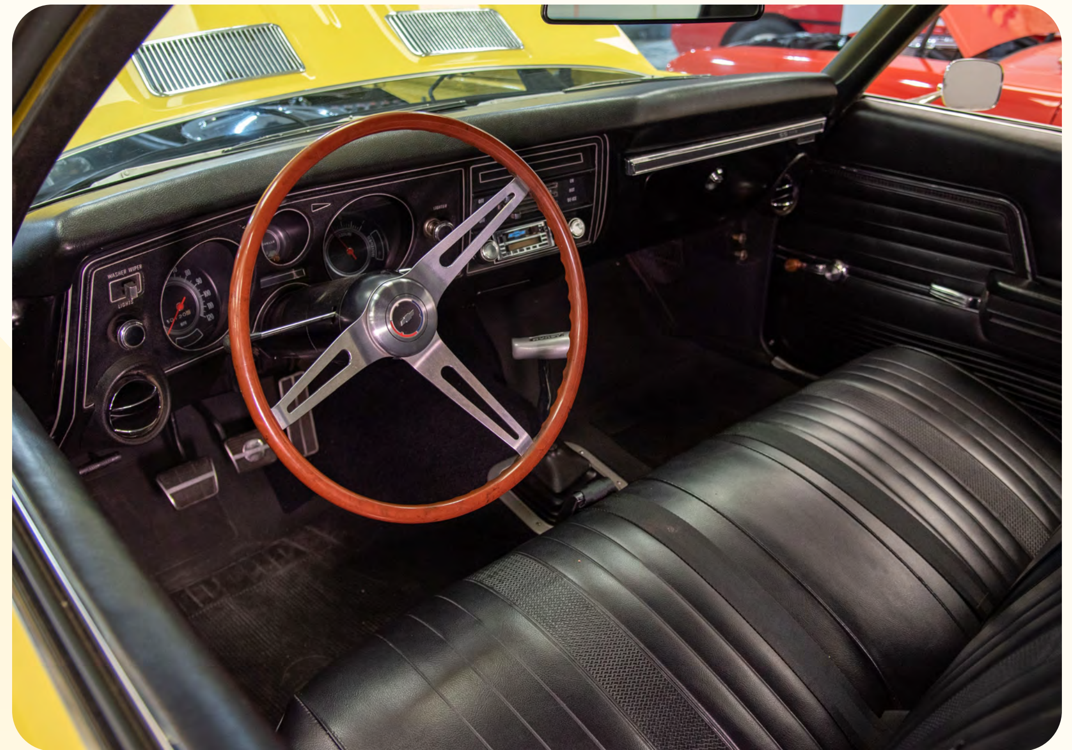
Muncie 4 speed with Hurst shifter