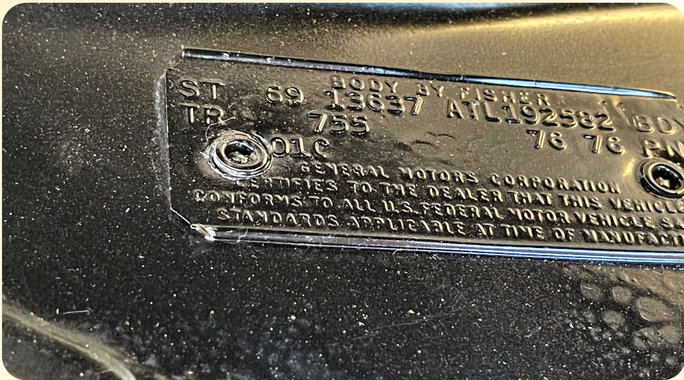
69 — 1969, 13637 — Chevelle Malibu Sport Coupe, ATL — Atlanta built, 755 — Black Bench, 76 76 — Daytona Yellow ($42.15 option only available with SS396)